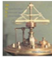
World Organisation of Systems and Cybernetics